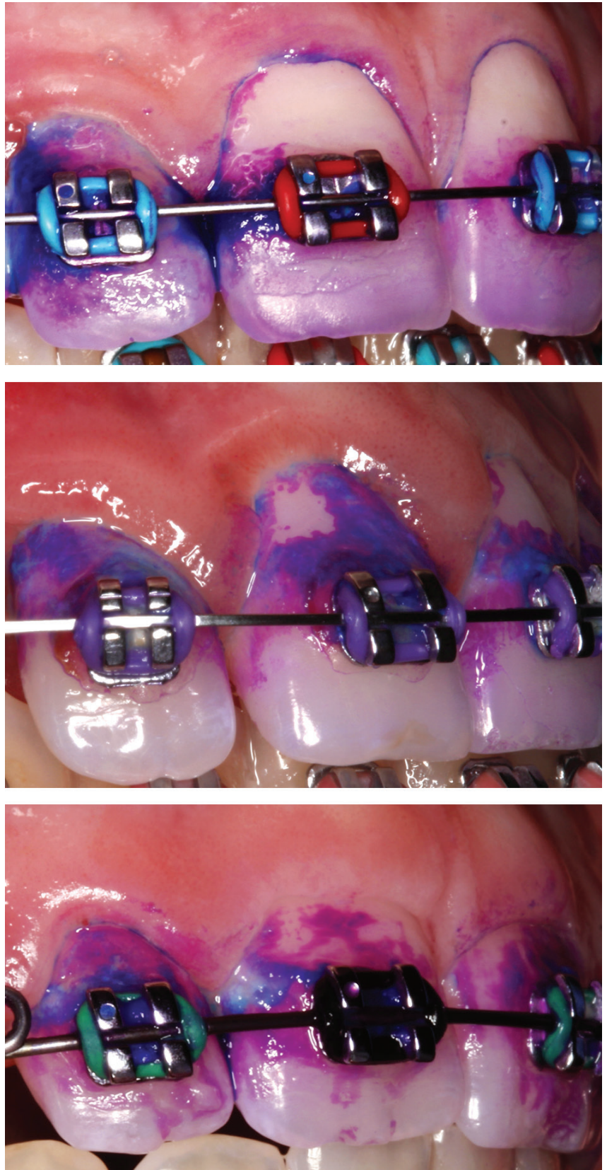
Figure 1. Three clinical examples of 3-colour disclosing gel (GC TriPlaque ID gel) used in orthodontic patients to show regional differences in the dental plaque biofilm.

Hence, as a strategy to control S. mutans , we want to encourage the growth of S. sanguinis . We can live in harmony with a thin dental plaque biofilm that is composed mostly of such early colonisers. 13