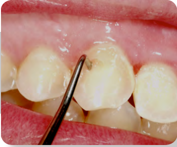
Facial caries of Maxillary Canine post orthodontic treatment. Spoon excavate infected dentin.