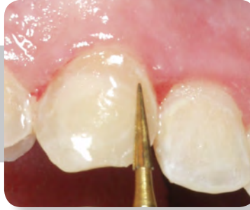
After injected EQUIA Fil, finish with carbide bur under water spray.