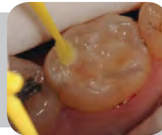
EQUIA Fil is injected directly into the preparation. No bonding is required.