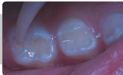
After application of GC CAVITY CONDITIONER and rinsing. EQUIA Fil is injected directly into the preparation.