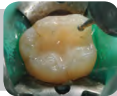
Minimally Invasive preparation design preserving tooth structure.