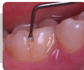
Spoon excavate remnant caries. Limit trauma and preserve tooth structure.