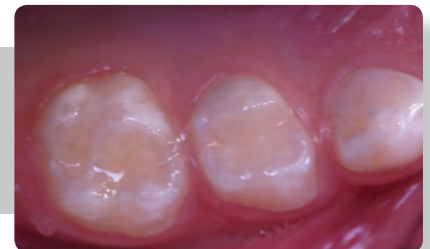
EQUIA Coat is applied then light-cured. Final restoration is conservative. Fast, parent and patient friendly.