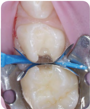
Minimally invasive preparation design. No bonding required. Ready for direct application of EQUIA Fil.