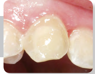
Finished restoration. Benefits: self-adhesive, higher translucency, high fluoride release, self-curing, reduce risk of secondary caries, finishing and polishing in 2 minutes, 30 seconds.