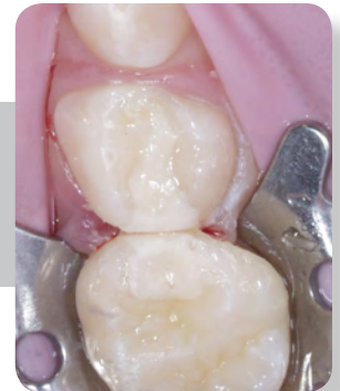
One thin layer of EQUIA Coat applied. Light-cured for 10 seconds for a fast, strong and aesthetic restoration.