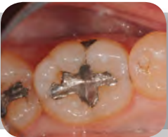
Defective amalgam. Minimally Invasive treatment indicated.