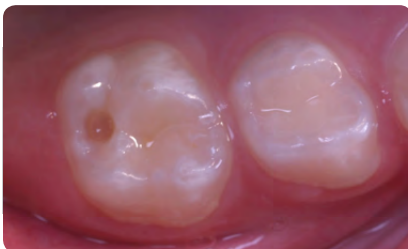
Minimally invasive preparation of deep occlusal pit. Limited trauma - quick process.