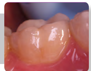
Finished restoration after direct application of EQUIA Fil and EQUIA Coat. Aesthetic and protective.