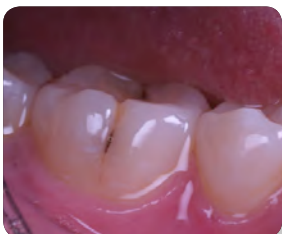
Buccal pit. Decision to utilize Minimally Invasive techniques.