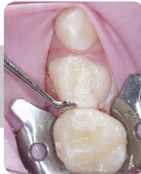
EQUIA Fil injected into preparation. Contoured and self-cured.