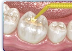
Apply EQUIA® Forte Coat.