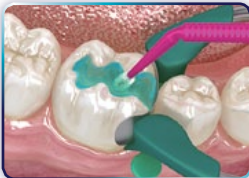
Prepare cavity. (Optional use of cavity conditioner.)