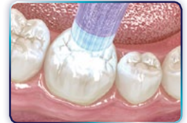
Light cure for 20 sec.

EQUIA® Forte has 20% higher flexural strength, 21% increased acid resistance and 40% improved wear resistance, when compared to original EQUIA®!