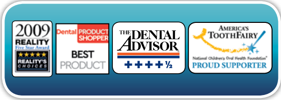
Ratings for GC Fuji IX GP EXTRA.