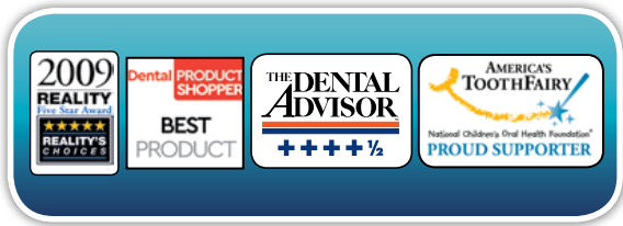
Ratings for GC Fuji IX GP EXTRA.