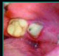
Clean and dry finished prep and temporary restoration.

Place a new automix tip on the syringe and express the material as needed to cement the restoration.