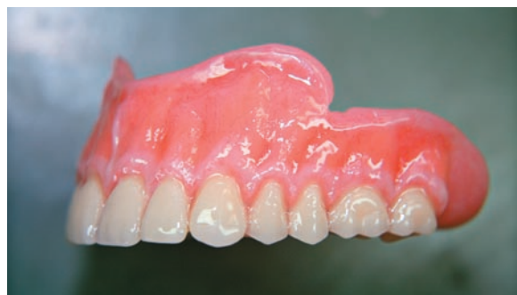
Fig. G Remove the air barrier coating by placing the denture in an ultrasonic cleaner.