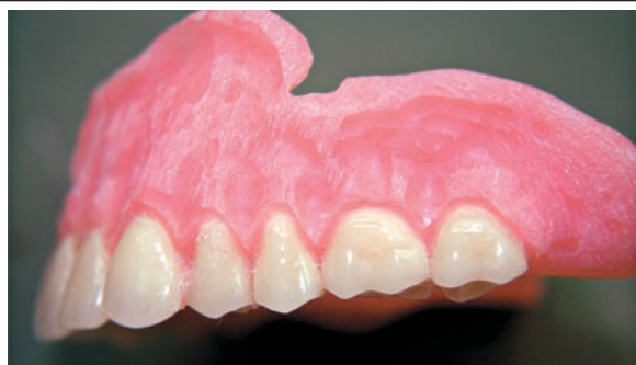
Fig. A Clean the denture in an ultrasonic cleaner, steam clean, then dry.