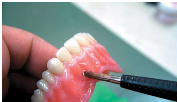
Fig. F Apply an air barrier for the final cure.