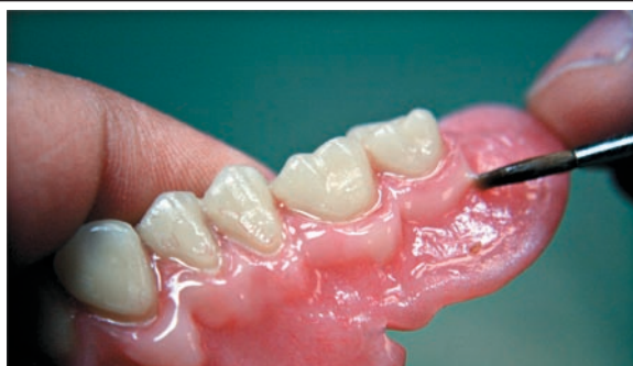
Fig. C Place GM35 around the gingival to create a blanching effect.