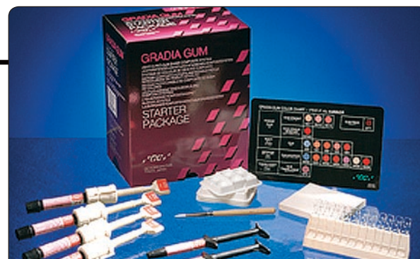
GC Gradia Gum Shades

02 Apply a thin coat of composite primer to the arbor-banded denture (Fig. B) and cure for one minute in the Labolight curing unit or two minutes in the Triad unit with the table rotating. Check the primer to ensure it is completely