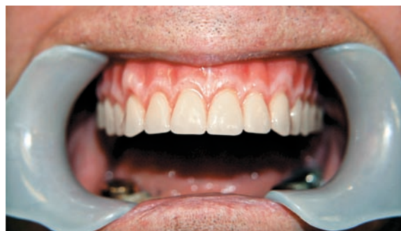
Fig. I The revitalized denture in the mouth.