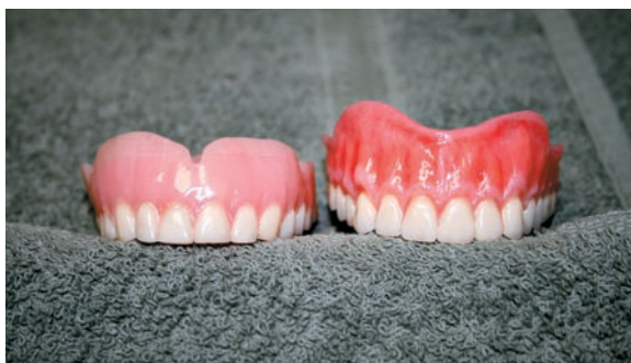
Fig. H The old denture (left) and revitalized denture (right).