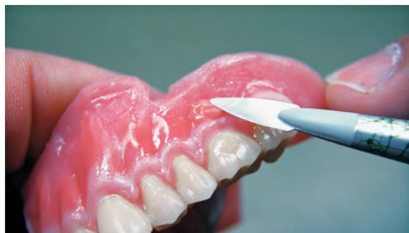
Fig. D Apply G22 or G24 Gum Paste with a spatula for form root structure and highlight the GM35 with contrast.