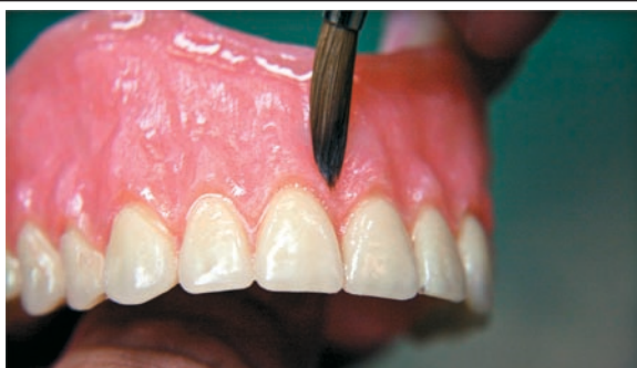
Fig. B Apply a thin coat of composite primer to the arbor-banded denture.