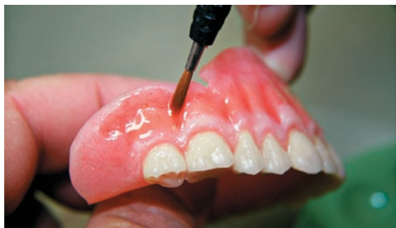
Fig. E Apply a mixture of GM36, ICO Clear, and GF71 gum fibers to the denture borders.