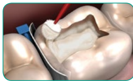
Class II preparation with shallow supragingival box. CAVITY CONDITIONER (GC) is recommended to remove the smear layer.