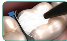
Apply G-Premio BOND ™ , then place G-aenial Sculpt ® composite, followed by light-curing.