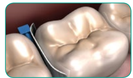
Final, esthetic glass ionomer and composite sandwich technique restoration.