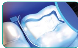
Light-curing of GC Fuji II LC ® .