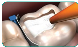
Placement of GC Fuji II LC ® occlusally.